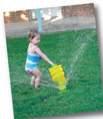
Summer water play at Fair Havens!