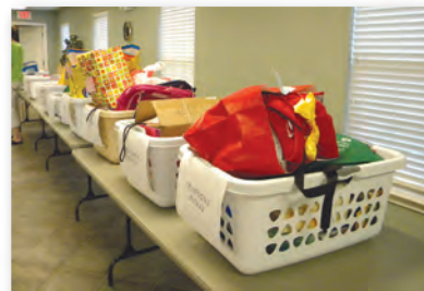
Our moms work hard to pursue their education in order to build a bright future for their families.

A special thank you to Business and Professional Women, Downtown Rotary Club of Midland, Dress 'em and Bless 'em with First Baptist Church, Westside Church of Christ and Legacy Real Estate, who all assisted families return to school this fall by providing school supplies, shoes, and clothes. Thank you and may you be blessed abundantly!